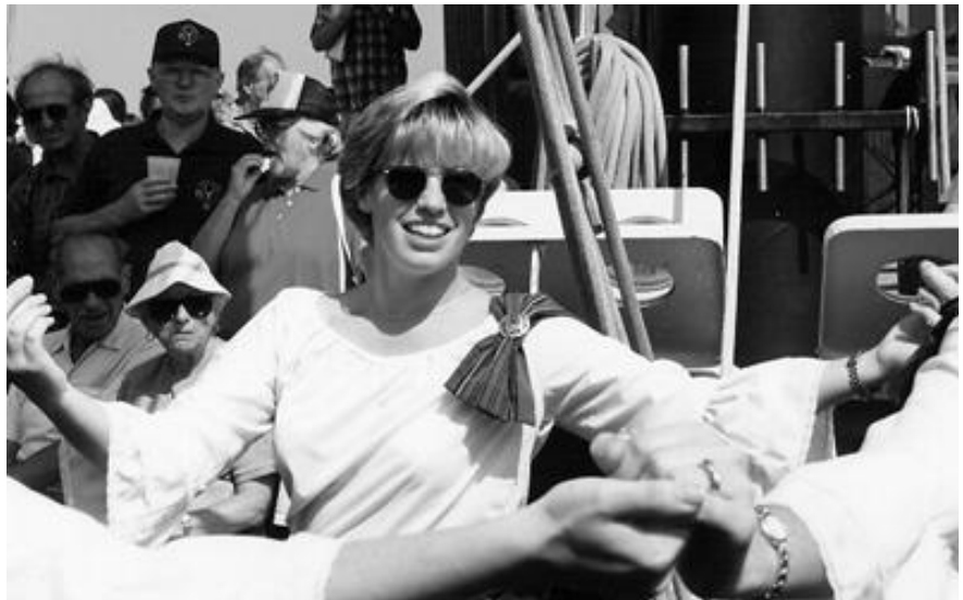
Scottish Country Dancing on the Empire Sandy